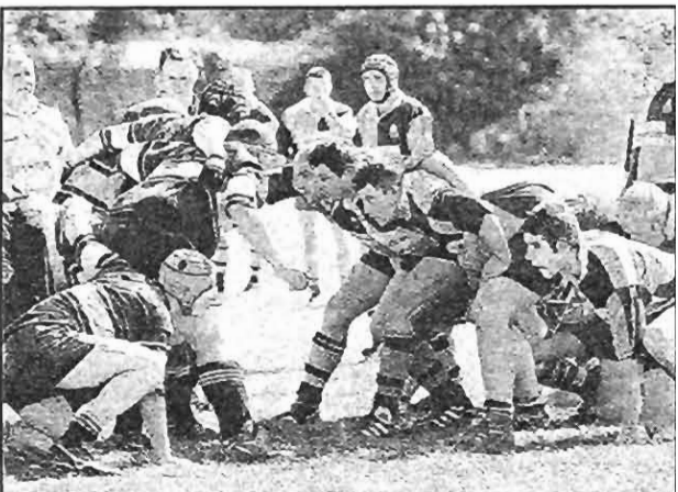
SCRUM ON DOWN: OPMs front row prepare to go head to head with DHS Old Boys in the Lockie Cup semi-final

Don't miss tomorrow's Herald Sport for full coverage of both finals